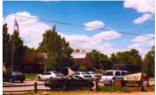
The Institute is funded in part by the U.S. Dept. of Agriculture (through the USDA NRCS). Shown here is the Ranger Station for the Santa Fe National Forest, near Glorieta.