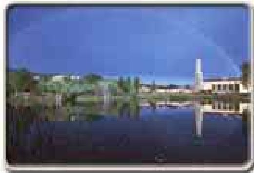
Glorieta Conference Center, as seen from across their lake.