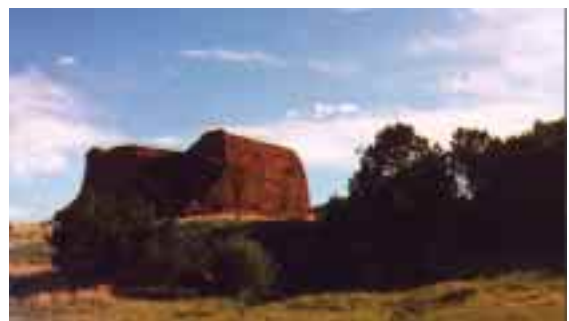
Students will visit the pueblo ruins at Pecos National Monument to explore how history, culture, and the environment are inter-related. The Institute is also supported by the National Park Service, who oversee Pecos National Monument.