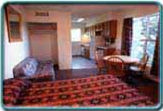
Glorieta has comfortable, modern sleeping rooms for attendees.