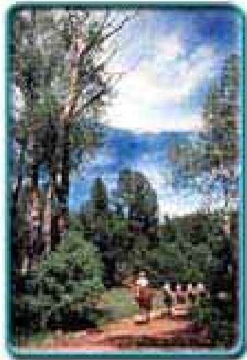
Attendees at Glorieta enjoy full use of the many nature trails that crisscross the Center.

These photos depict some of the actual places where the NHEC Institute will be held. All scenes are located at or near the Glorieta Conference Center in New Mexico.