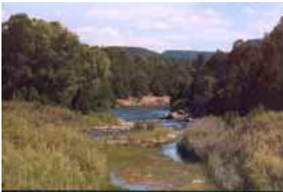
The banks of the shallow Pecos River is one location where students will learn principles about the role of water for people and the earth.