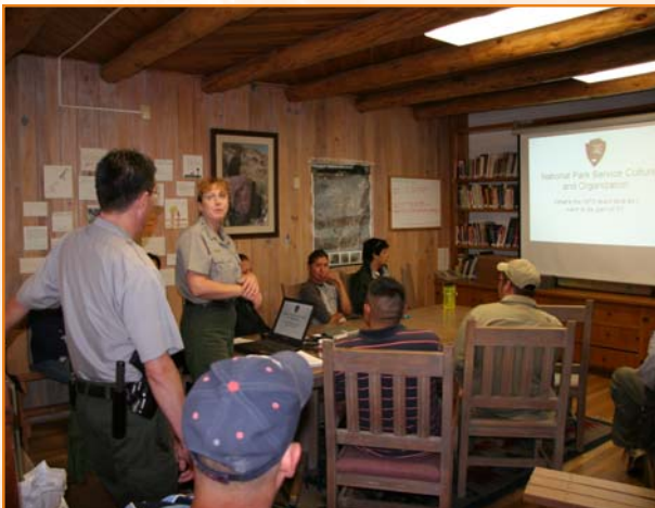
NPS staff at Petroglyphs National Monument, in New Mexico, talk to students.