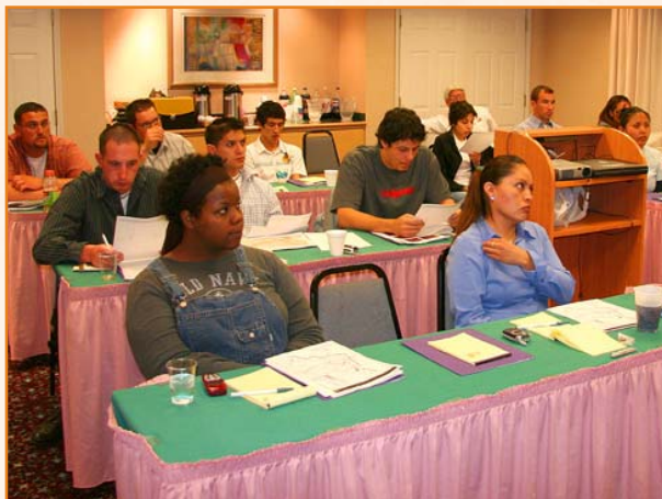
BABF student participants at the May 3–5 training session.