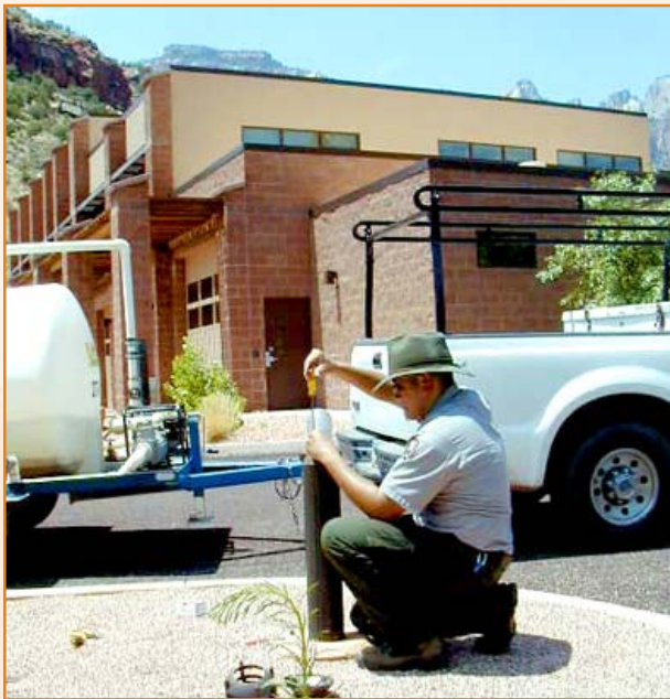
Students in the BABF internship program work both indoors and outdoors; at computers, with visitors, and performing facility operations work.