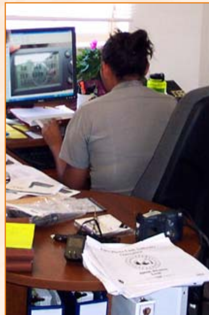
Students work in all aspects of facility maintenance and management while in the field at parks throughout the Intermountain region.