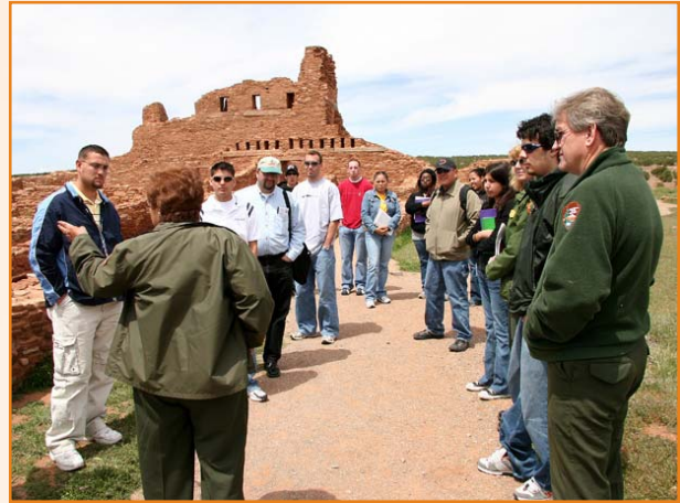
BABF students in the field at a national park