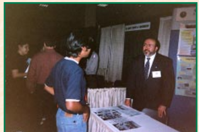
The NHEC Career Fair is a major vehicle to recruit top quality Hispanic environmental students and professionals.