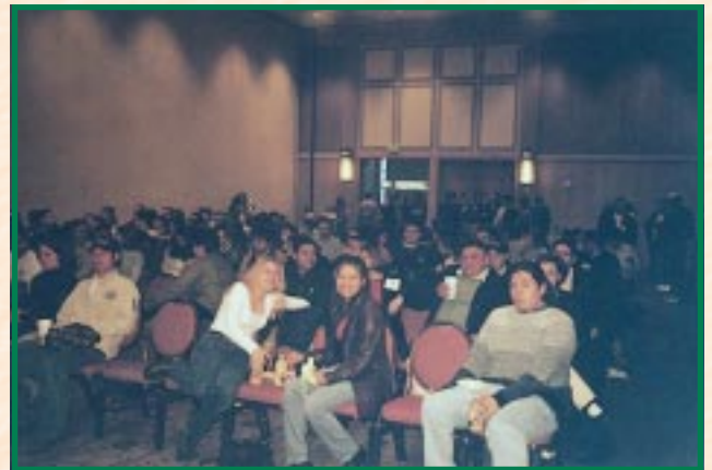
Students await the opening of the Conference general session.