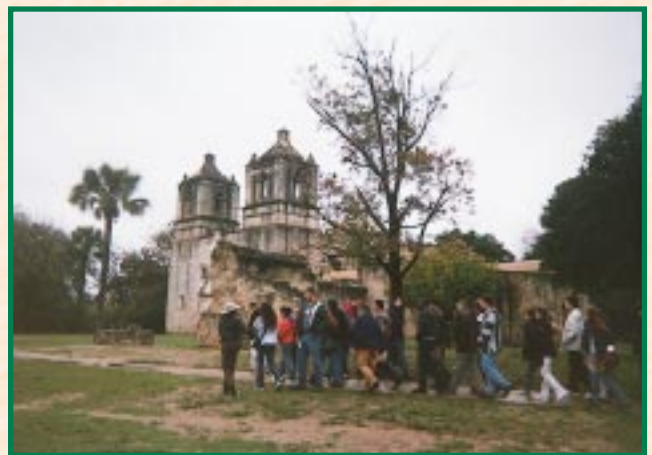
This site tour was of the "San Antonio Missions", a group of churches and other places dedicated to the history of Hispanics in South Texas. Site tours also include cultural and historical sites, in addition to environmental facilities.