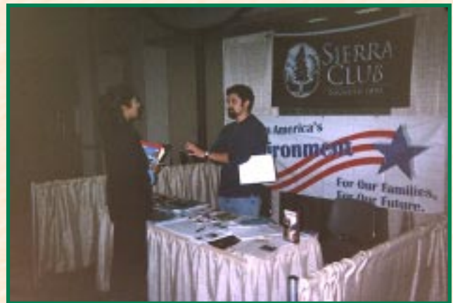
There are recruiters from the public, private, and non-profit sectors at the Career Fair.