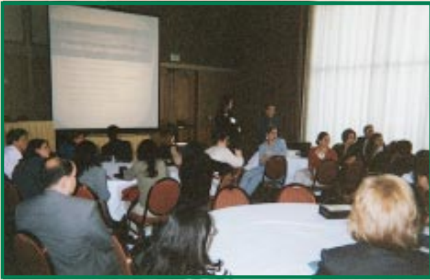
Workshops are a key part of the Conference. The Conference features top experts on panels addressing a wide range of environmental and natural resource issues.