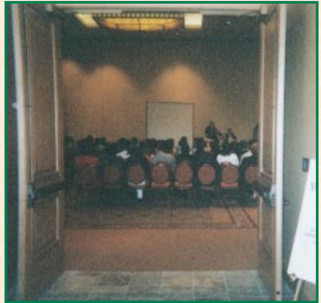
Students attending some of the 25+ workshops the Conference offers each year.