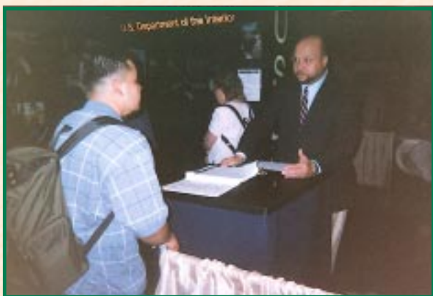
Federal agencies like the U.S. Dept. of Interior, U.S. Dept. of Agriculture, and EPA have been major sponsors of the Conference.